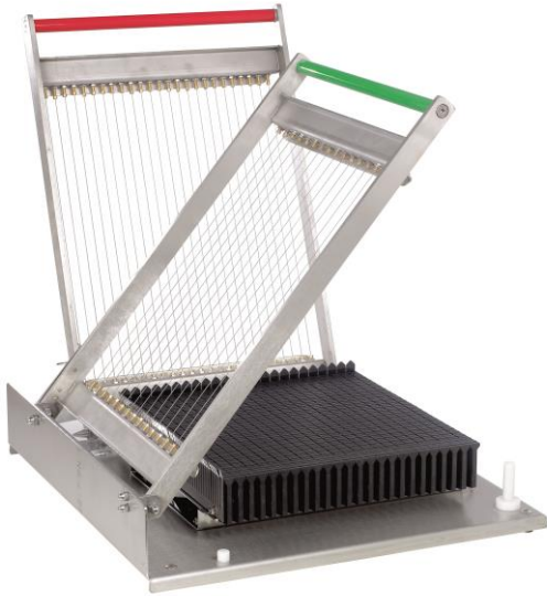
F37610 DOUBLE GUITAR BASE (Sold without Frames)