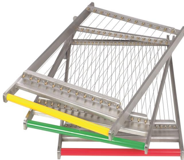
F37611 CUTTING FRAME N°1 - 15 mm - color Red arm F37612 CUTTING FRAME N°2 -22.5 mm - color Green arm F37613 CUTTING FRAME N°3 -30 mm - color yellow arm